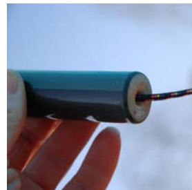
P&B Epoxy Bung + Cutting Fitting