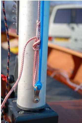
Screw R2850 Eye mount to bottom of Mast (You might already have this to hold the Mast Step on)

Elastic Goes through Block and down to the bottom of the Mast