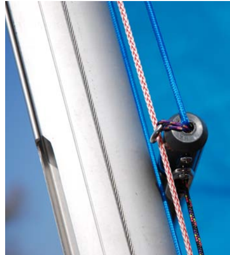
Jib stick runs up and down D12 on stainless steel ring Fixed to pole end.

Elastic draws stick upwards and out the way when not in use.