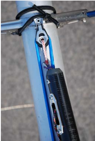
Rivet A2026 on Centre Rivet hole in Spreader bracket